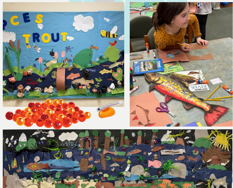
Above Left Photo: PCES 5th and 6th grader's river habitat mural. Photo below: SeDoMoCha 4th grade's river mural. Nice work all!

PCSWCD hopes to keep expanding our Trout in the Classroom program each year - where will we be next year?